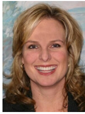
Chief Judge Leah Case

Practice Area: As a lawyer, my area of practice was Criminal. As a Judge, I have presided over Criminal, Civil, and Dependency/Delinquency dockets.